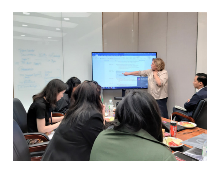
Mentoring session of Australian experts and TPQI working group on setting up ICB on 26 Mar 2019