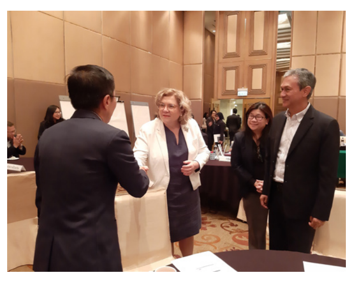
Logistics and Supply Chain Industry Competency Board Information Session on 27 Mar 2019

o Since 2018, the then Australian Government Department of Education has hosted seminars and workshops with TPQI to mentor Thailand on the necessary steps to form the first ICB in Thailand which is ICB in Logistics and Supply Chain. The first ICB in Thailand is scheduled to roll out in 2020 which will be followed with the establishment of the two new ICBs in Healthcare and Tourism.